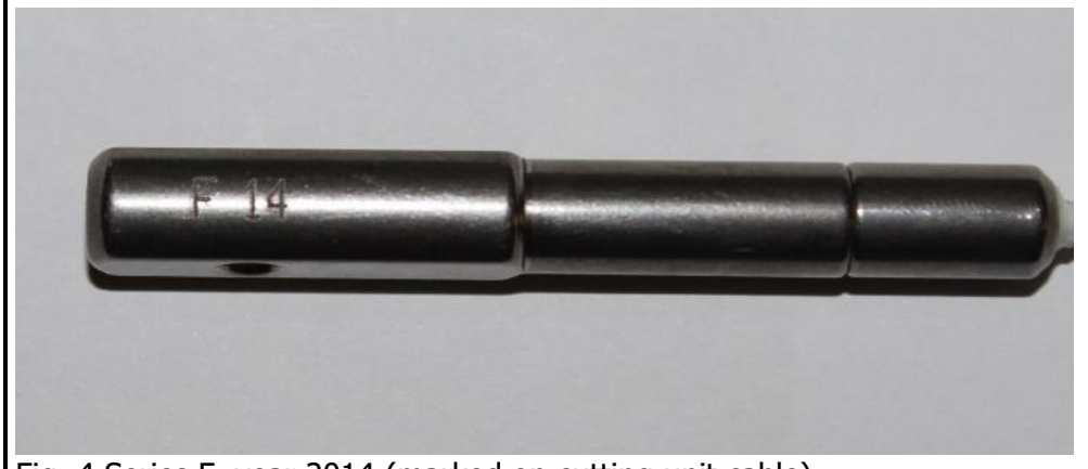
Fig. 4 Series F, year 2014 (marked on cutting unit cable)