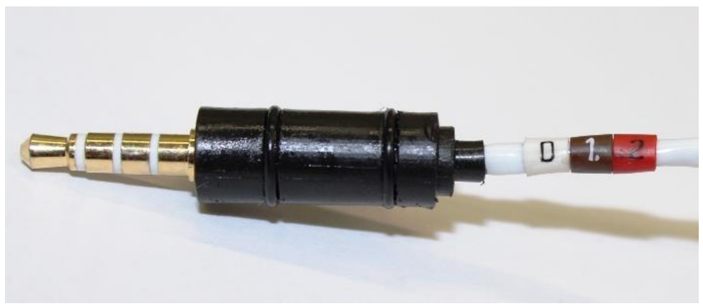
Fig. 3 Series D, year 2012 (marked on cutting unit cable)