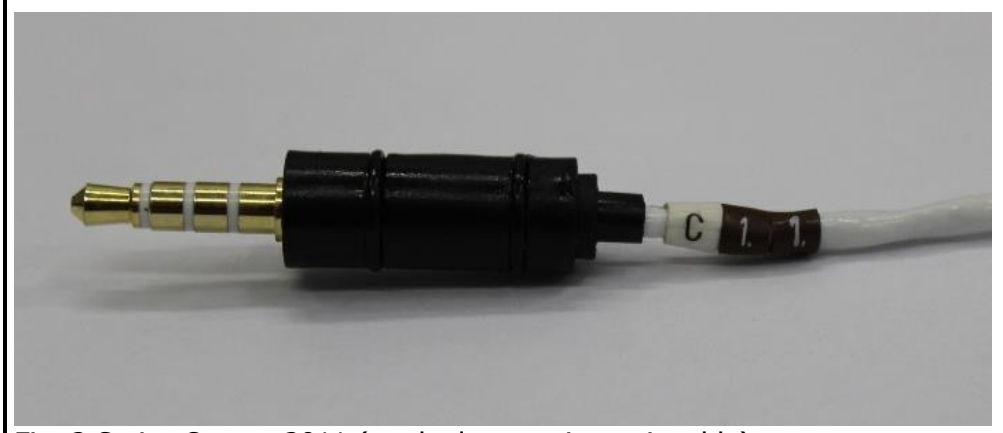
Fig. 2 Series C, year 2011 (marked on cutting unit cable)